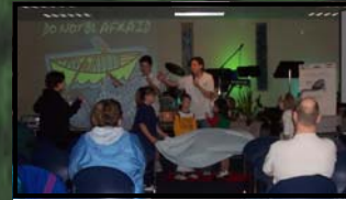
The kids help act out a Bible story.